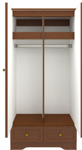
Model: LAALZ 34.5W 23.75D 71H

Kwalu's Lancaster Dementia/Alzheimers Wardrobes are thoughtfully designed to support resident independence and safety. Light colored interiors help with spatial orientation. Features include softly rounded edges and waterfall detailing. Hidden door latches and passive locks allow caregivers exclusive access. Choose from dozens of hardware styles, including ADA-compliant. The product is required to be wall mounted for safety. Using the kit provided, please follow provided instructions exactly.